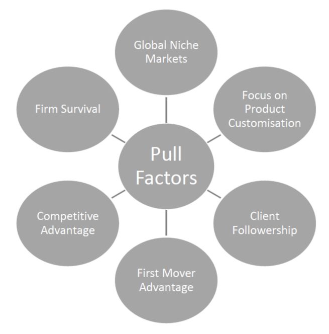
Figure 1. Pull factors in early internationalisation

"Starting to have a look at what the competition was in Europe, we found out that the competition was substandard. Their websites weren't anywhere near the quality that ours was." (Company D)