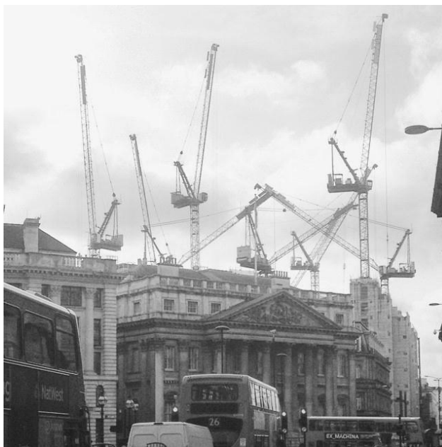
Figure 1. London skyline, February 2015

The research examined Skyscraper Indicator and its application in the UK. The study employed UK GDP and GDP per capita as a macro variables and a series of dummies for construction starts, durations and completions of the record-breaking buildings in the UK.